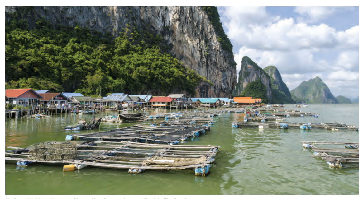
Ko Panyi fishing village at Phang Nga Bay, a National Park in Thailand

Step 3.a Understanding climate change hazards: