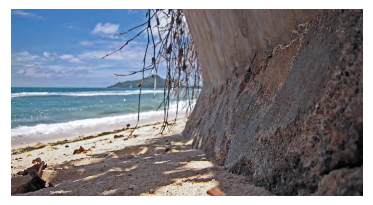
Protective stone wall by the roadside, Seychelles

Monitoring can be resource- and time-intensive, so careful consideration is recommended in deciding what to measure and how, and which indicators will be used to serve this purpose. The M&E process should also include elements to ensure accountability and transparency (for example, regular performance assessments, and the participation of stakeholders). Equally important is considering the availability of information for monitoring,