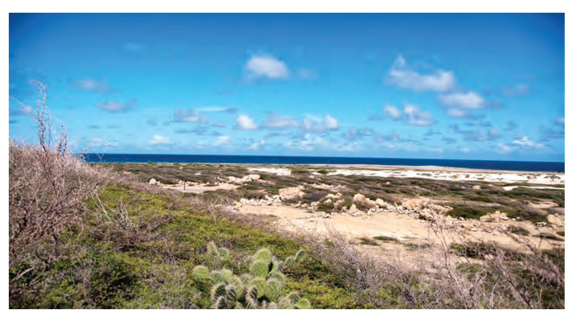
Wild seaside landscape in Aruba in the Caribbean

As sea levels rise, low lying areas are increasingly at risk of inundation. Coastal retreat is the proactive determination and implementation of realistic setback lines along coasts, whether the land affected is urban, rural or agricultural in nature (Roets and Duffell-Canham 2009). Managed realignment (also known as managed retreat, dike realignment, dike reopening, de-embankment and de-polderisation) and coastal set-backs are two forms of coastal retreat. Managed realignment is the deliberate altering of flood defences to allow planned flooding of a presently defended area. Coastal setback is a planning tool that identifies a zone next to the existing shoreline which is then managed as a type of buffer zone. It predefines distances from the shoreline or elevations from sea level and then excludes development (e.g. infrastructure) or restricts the types of activities in these areas where there is coastal hazard risks (Linham and Nicholls 2010).