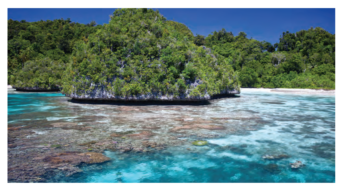
In Indonesia, the northern Raja Ampat limestone islands protect a beautiful lagoon where a shallow coral reef thrives