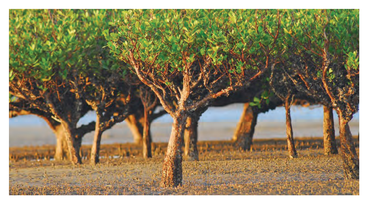
Mangroves in the Lamu area, Indian Ocean coast of Kenya.

Mangroves are trees or large shrubs which are salttolerant and grow in intertidal zones in tropical and subtropical regions (Spalding, Kainuma, and Collins 2010). They form dense forests along many tropical and subtropical coasts, are found in 123 countries and territories and are estimated to cover over 150,000 square kilometres globally (Spalding et al. 2010). Mangroves form two groups known as true mangroves and associate mangroves. True mangroves are highly adapted to the intertidal zone where all or part of them are regularly submerged in saltwater. The length of inundation tolerated varies between true mangrove species.