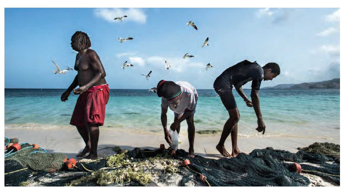
Fishermen clean out their nets in Grenada, Seychelles.

Collects the methods, achievements, and problems of measures including 1) seeding production and settlement induction by utilizing coral sexual reproduction, 2) transplantation of coral fragments by utilizing asexual reproduction, 3) transplantation of colonies or entire reef and 4) management of settled seeding, transplanted colonies and coral communities.