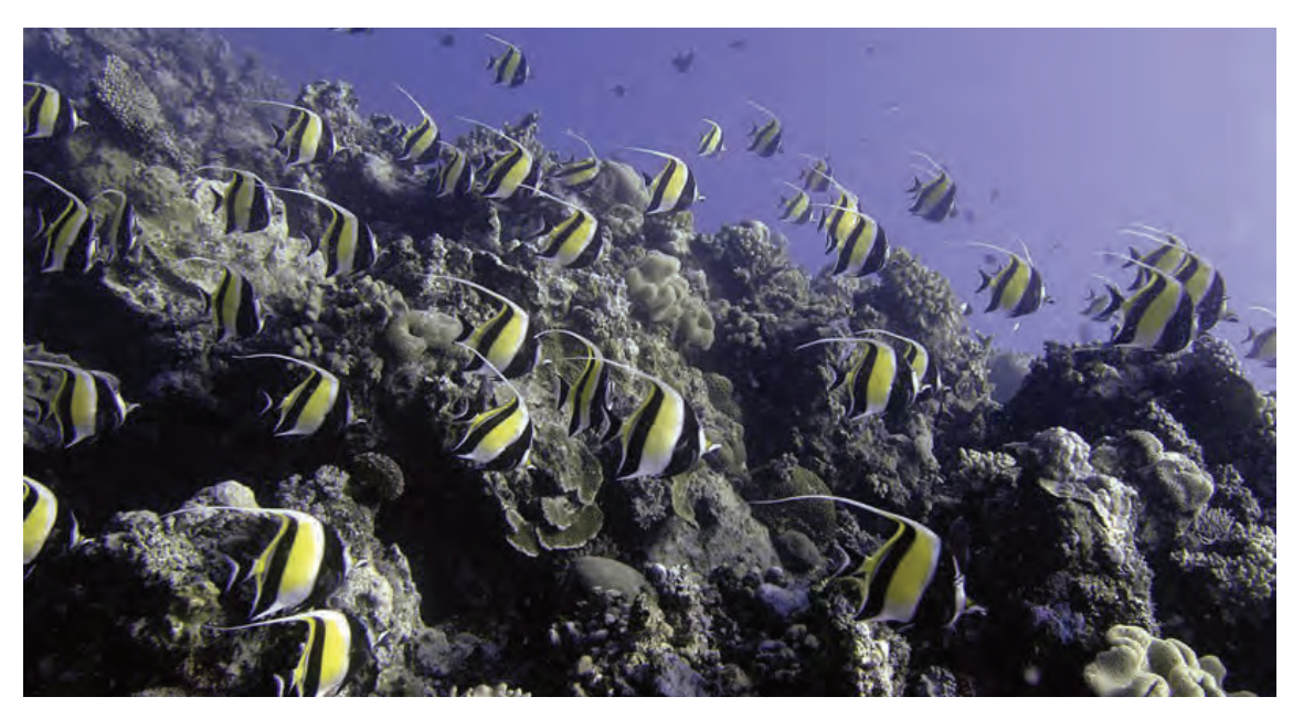
Coral reefs are the most diverse and beautiful of all marine habitats. Large wave resistant structures have accumulated from the slow growth of corals. The development of these structures is aided by algae that are symbiotic with reef-building corals. Coralline algae, sponges, and other organisms, combined with a number of cementation processes also contribute to reef growth.

Coral reefs are marine ecosystems located in shallow coastal zones of tropical and subtropical regions. The ecosystem is shaped by the calcium carbonate structures secreted by the coral polyps (Kleypas, 2012). Coral reefs occupy a small percentage of the world's oceans, but they contain a disproportionately high share of its biodiversity (Pandolfi et al. 2011).