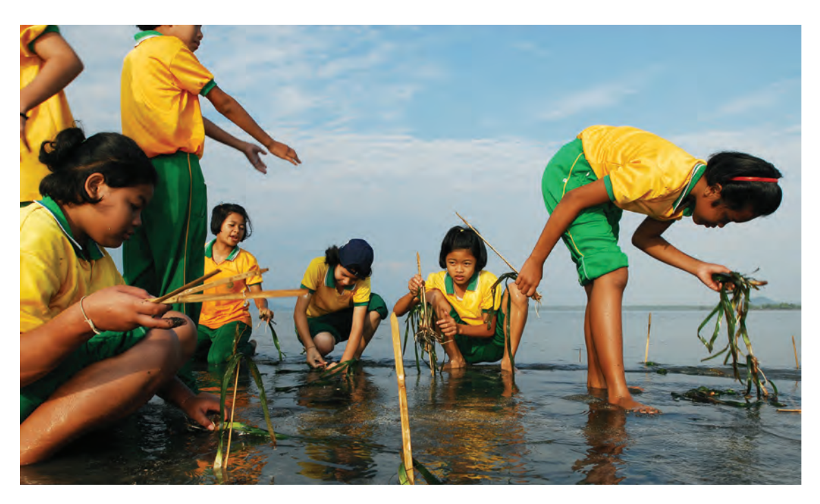
Children are planting tiny seagrass in the sea in Nakronsrithamaratch in Thailand.

The contribution of seagrass beds to stable fisheries may mean that communities that do not presently rely on fisheries as a source of livelihood could benefit from this source of livelihood in the future, if other livelihoods come under threat.