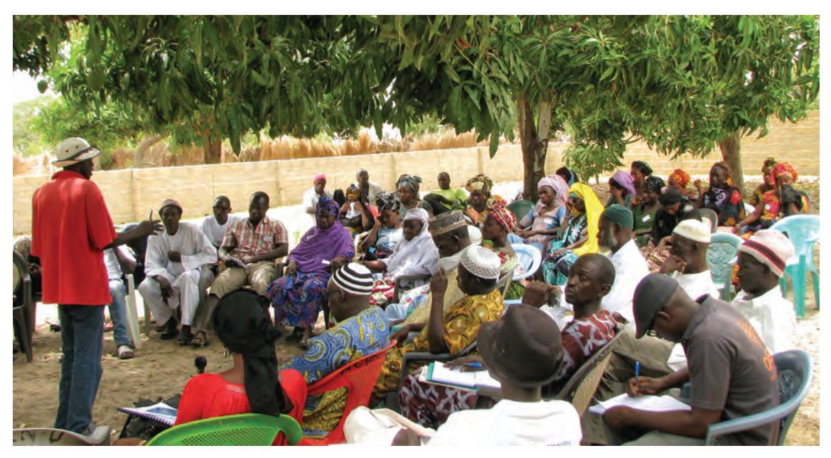
Discussing existing environmental issues in Niumi National Park in The Gambia

Coastal EBA is an approach to the management of coastal areas that seeks to build the resilience of coastal