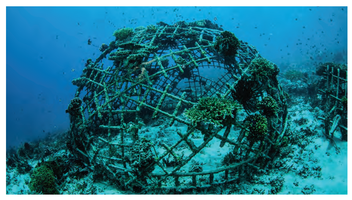
Biorocks of coral reefs in Lombok, Indonesia.