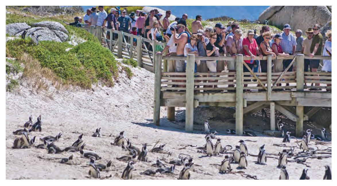
African Penguin (Spheniscus demersus) tourist attraction at Boulders Beach, South Africa. The African Penguin (the only penguin species breeding in Africa) is one of the species to which the Agreement on the Conservation of African-Eurasian Migratory Waterbirds (AEWA) applies. The African Penguin is also listed in the Red Data Book as an endangered species. These are important to take into consideration in policy-making