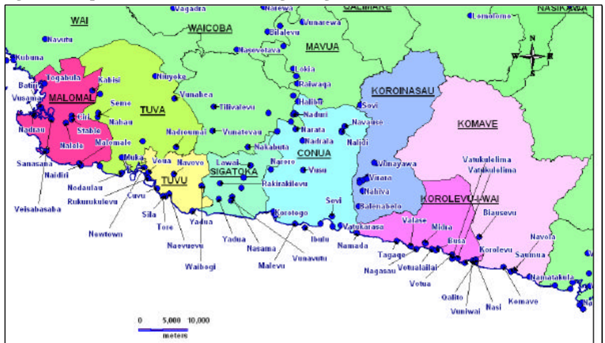
Figure 1. Map of the Coral Coast showing Villages and Tikinas

The following sections presents a summary of what was undertaken and what has been learned so far about the nature of the issues. Progress made in carrying forward activities is described for each issue, and reflections and lessons learned are offered toward a sustained, long term ICM effort. The final chapter provides additional reflections on the implications of the work to date in the Coral Coast in extending ICM nation wide, in view of the Ten Priority Actions agreed to at the first national workshop in 2002.