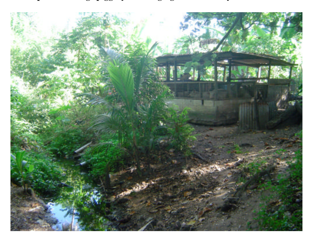
Figure 6. Example of a village piggery discharging waste directly into a creek