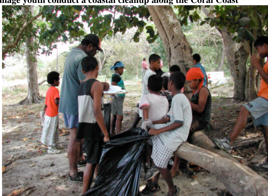
Figure 5. Village youth conduct a coastal cleanup along the Coral Coast