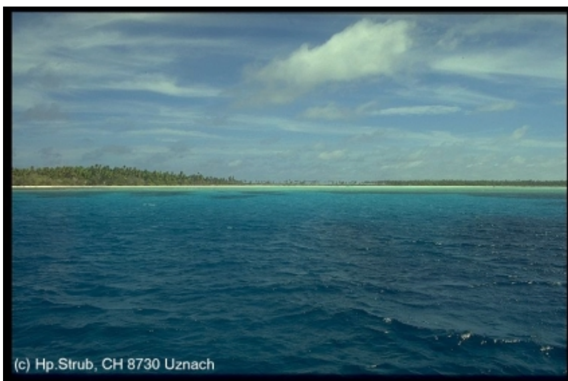
Fig.2 Atolls barely surface above the sea

*includes Ananau causeway reclaimed area.