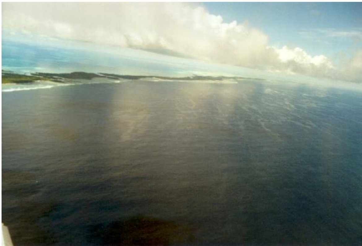
Fig.5: Atolls are most vulnerable to sea-level rise

In conclusion Kiribati atolls are most vulnerable to climate change and sea-level rise. It is most likely that complex patterns of erosion, accretion, in association also with coastal protection work, and gradual retreat along the width of the atoll, would take place. In the meantime, the atolls are vulnerable to extreme weather conditions such as storms, and drought to occur now under a reduced length of the period without rain.