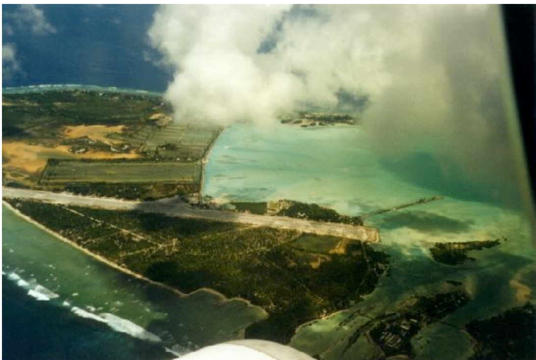
Fig.4: Coastal indeterminate boundary between land and the sea across the atoll. However, traditionally the narrow strip of land parallel to the shoreline and few meters inland is regarded as “Mataniwin te aba” which has the literal translation of “leadership land”.

In summary, water lens would be affected through erosion that might be associated with sea-level rise, but intense rainfall would tend to improve the quality of the ground water lens within the atoll. There could be problem when the water lens get very close to the land surface.