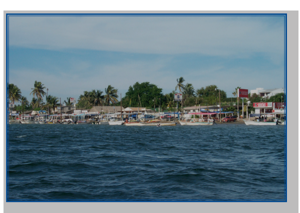
Uncontrolled development along the coast results in conflicts over access, increased demands on infrastructure, degraded water quality and increased risks to natural hazards. Sinaloa, Mexico

Mangroves, coral reefs, estuaries, seagrass beds, dune communities and other systems on or near shorelines serve critical ecological functions that are important to human society. Such functions include fisheries, storm protection, flood mitigation, erosion control, water storage, groundwater recharge, pollution abatement, and retention and cycling of nutrients and sediments. Healthy habitats function as self-