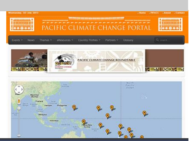
Pacific Climate Change Portal homepage