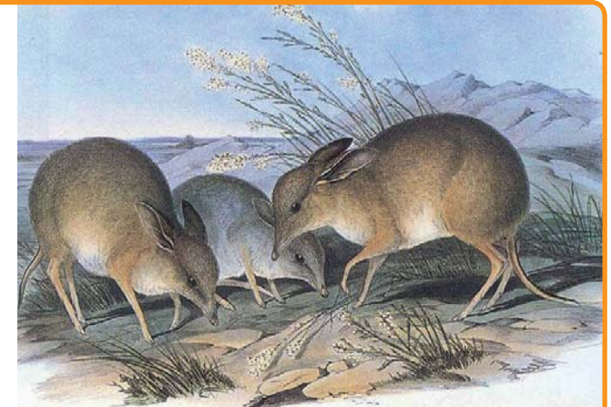
Pig Footed Bandicoot ( Chaeropus ecaudatus ).

2 endemic rodents on Christmas Island due to infection by a trypanosome blood parasite from introduced black rats.