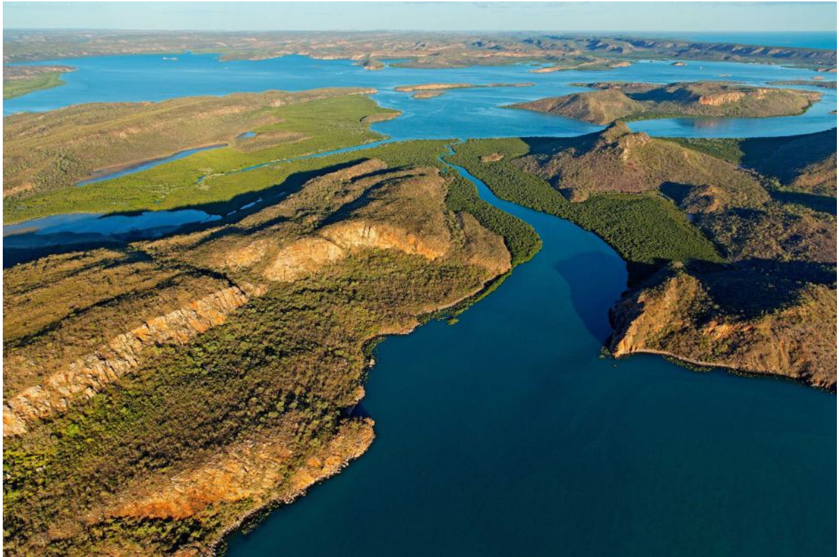
Yampi Sound Military Training Base in the Kimberley may well be an 'OECM' – do you know what that means? – You should!