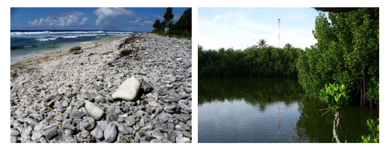
Fig. 5. Coral rubble rampart caused by tropical cyclone waves and surge the most recent serous event being Tropical Cyclone Bebe in 1971 (left); back-beach basin bordered by mangroves, togo (Rhizophora stylosa), east Fogafale Islet, Funafuti (Photos: R. Thaman 2010, 2016).