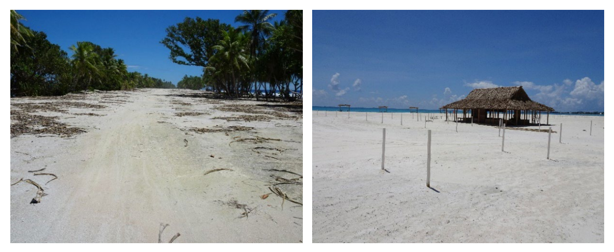
Figure. 6. Former borrow pits north of the garbage dump reclaimed in 2014 and infilled with lagoon sediment dredged from Funafuti Lagoon (left); and the extensive reclaimed area on the lagoon side of the Tuvalu Government Building and Vaiaku Lagi Hotel, which was formerly opened as Queen Elizabeth II Park in early 2016 (Source: Thaman 2016).

The substrates and soils of Tuvalu are among the poorest in the world. They include exposed limestone rock, beach or reef rock, sand and gravel, loamy sands, acid peat soils, swamp or hydromorphic organic soils or muds created in excavated taro pits, and artificial soils. The natural soils are normally shallow, porous, alkaline, coarse-textured, and have carbonate mineralogy and high pH values of up to 8.2 to 8.9 and are usually deficient in most of the important nutrients needed for plant growth (Morrison 1987; SOPAC 2007). In late 2015, the reclamation and infilling of extensive areas of borrow pits with dredged lagoon sediments was completed on both north and south Fogafale Islet adding a significant area of mainly biogenic sand of foraminiferous origin along with varying proportions of calcareous algae, coral and shells remains (Fig. 6).