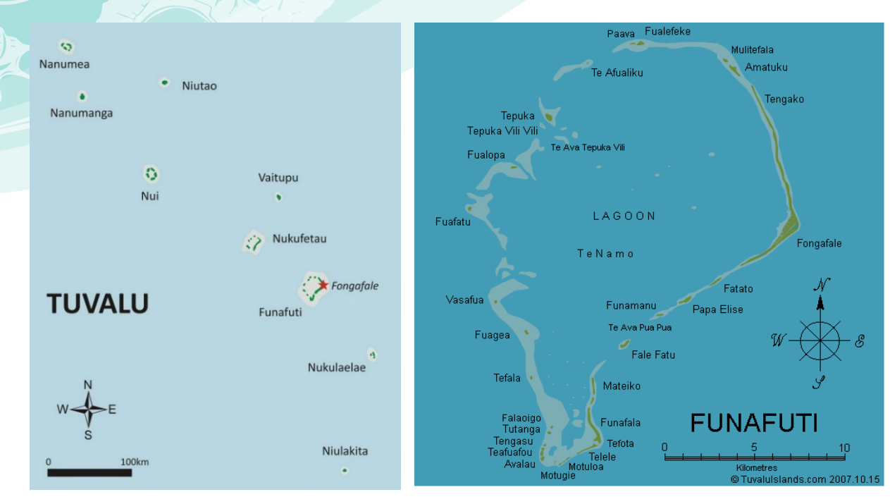
Figure 2. a) map of Tuvalu showing the locations of the nine atolls from Nanumea in the northwest to Niulakita in the southeast (left); and b) map of Funafuti Atoll showing the central lagoon and the individual reef islets (motu) , including Fogafale Islet, the largest and most populated islet and capitol of Tuvalu, along the eastern side of the Lagoon