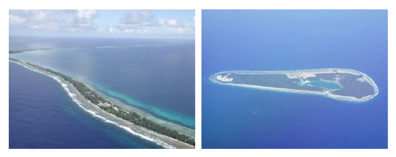
Figure 3. Aerial photos of Fogafale Islet, Funafuti Atoll (left) showing the open ocean on the left and the central lagoon on the right; and Vaitupu Atoll (right) with two small almost landlocked lagoons (far left and centre right).

Funafuti, the most highly populated atoll and capital, has 33 islets encircling a lagoon with a land area of about 275 km<sup>2</sup>. One-third of the total area of Fogafale has historically been unavailable to development until late 2015 due to the presence of the airstrip and the highly-degraded "borrow pits" from which soil, sand and aggregate were excavated to build the airstrip during World War II (Carter 1984; Smith 1995). In 2015-16 the barrow pits were reclaimed by infilling with marine sediments dredged from Funafuti's central lagoon.