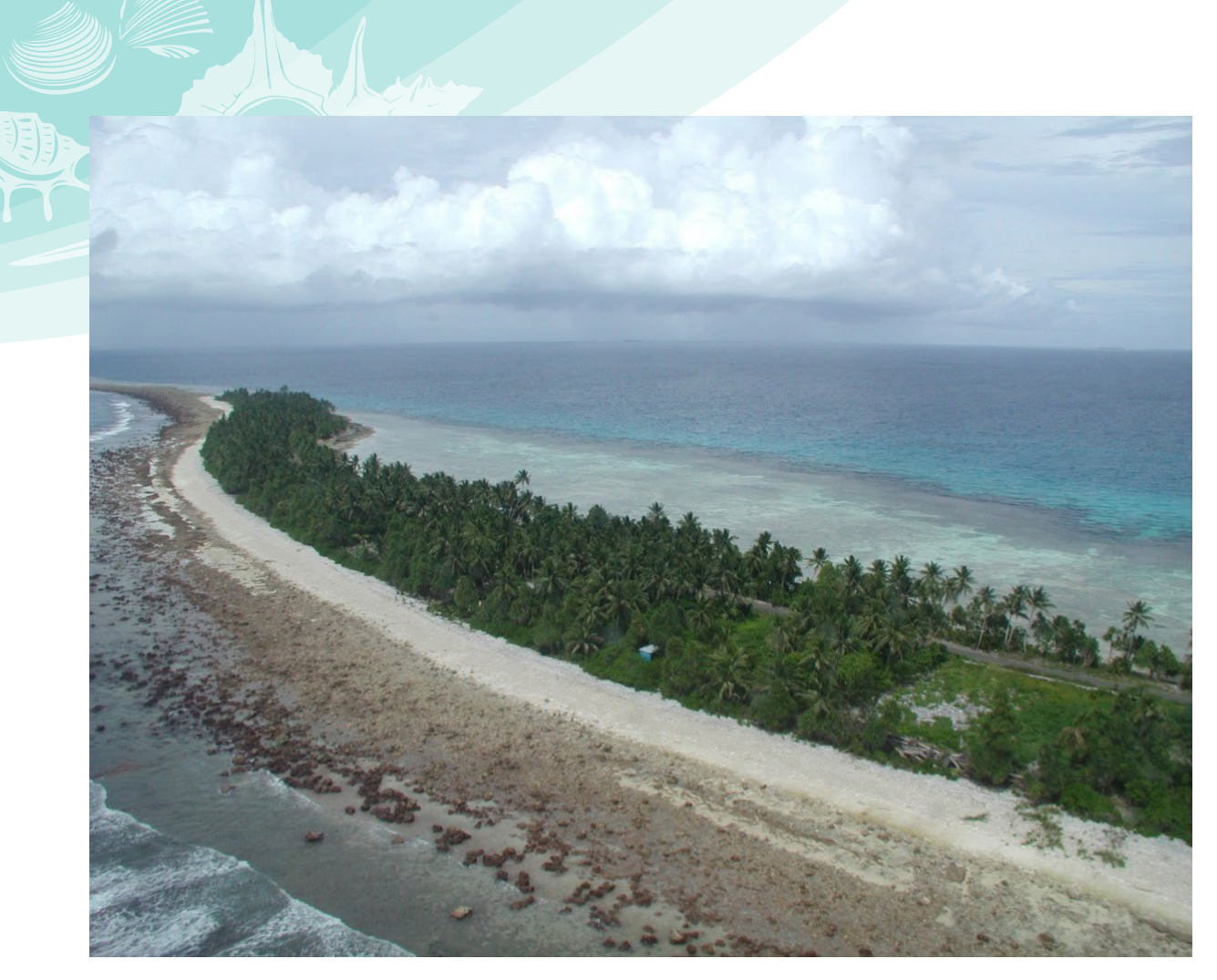
Figure. 4. Aerial view looking west across south Fogafale Islet, Funafuti Atoll, Tuvalu showing the Raised ocean side fringing reef encrusted with red coralline algae, the intertidal reef flat, beach and upraised coral rampart, inhabited and vegetated zone and the central lagoon (Source: Thaman 2016).