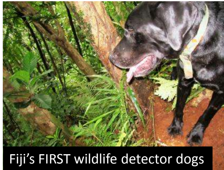
Fiji's FIRST wildlife detector dogs