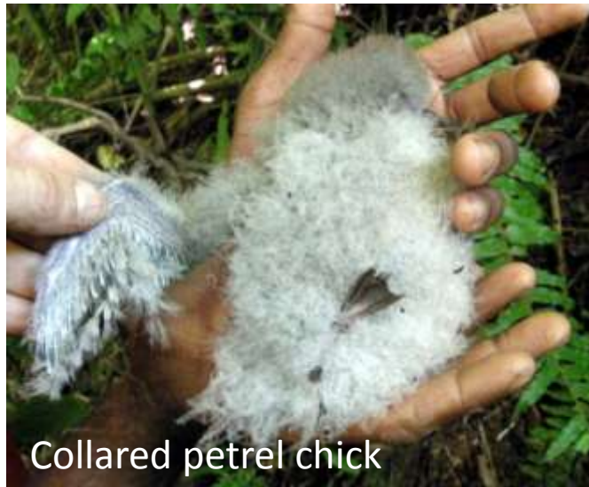
Collared petrel chick