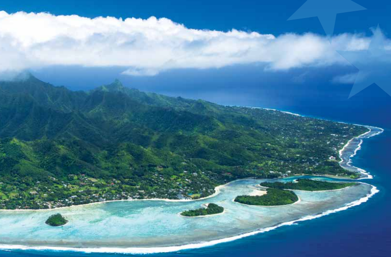
COOK ISLANDS STATE OF ENVIRONMENT REPORT 2018

We can use the assessment of these indicators to make informed decisions on development issues, or when creating national policy and legislation. Given the range of themes, their sub-topics and related indicators, our SoE Report can also assist with assessing and creating responses to crosscutting issues outside of the environment.