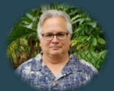
It is a great honour to have the opportunity to work with the fifteen countries participating in the PacWastePlus program. I have for most of my career worked to safely manage and dispose of hazardous materials both in the USA and abroad. I look forward to bringing those skill sets to the nations working in partnership with SPREP in this program."

"I am excited to be working with our member countries. In addition to the in-country project that will be designed by members to meet their waste priority areas, I think a valuable benefit from PWP will be the collection and distribution of regional data, and being the link to sharing information and learnings."