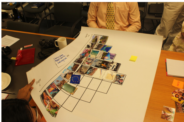
Plate 3. Q-sort activity

language and transcribed immediately with the assistance of a translator. The number of participants varied between each of the focus groups (Table I).