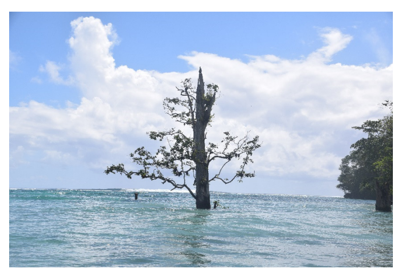
Figure 8. Rapid subsidence on the southeast coast of Malaita (J. van der Ploeg, 2017).

on the disappeared Pororourouhu Islands off the coast of South Malaita [71]). Other coastal areas on Malaita are also subject to geological upheaval: Gold [72], for example, reports that two severe earthquakes in October 1931 destroyed several artificial islands in Bina Harbor in Langalanga Lagoon. In fact, fear for an impending tsunami or cyclone is an important motivation for many wane asi to move from the artificial islands to the mainland.