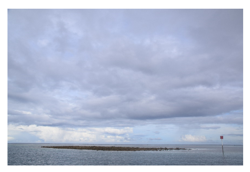
Figure 7. Rarata Island in Langalanga Lagoon.

A geological survey in 1990 concluded that, during the northwestern monsoon winds from September to March, the so-called koburu, currents are eating away the eastern side of Kwai Island [63]. Most of the sand is trapped at the southern part of the island, a process that is reversed during the ara season when the wind blows from the southeast. Overall, the island has not changed significantly in size since the 1960s. But nowadays there are more permanent houses on the island, which has led to deforestation. Whereas the island was covered with forest in the 1960s, there are now virtually no more trees on the island. Particularly, the cutting of large dalo trees ( Calophyllum inophyllum ) along the shoreline for firewood and to make space for houses seems to have worsened the coastal erosion problem.