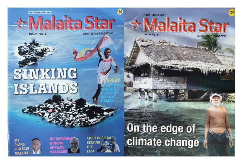
Figure 1. The sinking islands of Malaita (Malaita Star, 2016, 2017).

Similar claims are regularly made in science, policy, and development discourses. There is broad scientific consensus that people on low-lying islands in the Pacific are highly vulnerable to future climate-induced sea-level rise, and that there is an urgent need to invest in adaptation mechanisms [2,3]. But little is known about how local people in remote rural areas, such as Malaita, perceive and deal with climate change [4,5]. Rebecca Monson and Joseph Foukona [6] write in an edited volume on climate displacement that the wane asi in Lau Lagoon increasingly have to cope with changing wind patterns, extreme weather events, and coastal erosion: