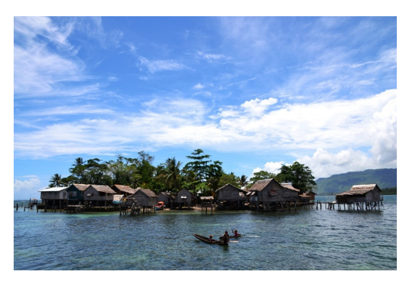
Figure 3. Funafou Island in Lau Lagoon.

islets are just above the high-water mark (<30 cm), and most houses are constructed on stilts (see Figure 3).