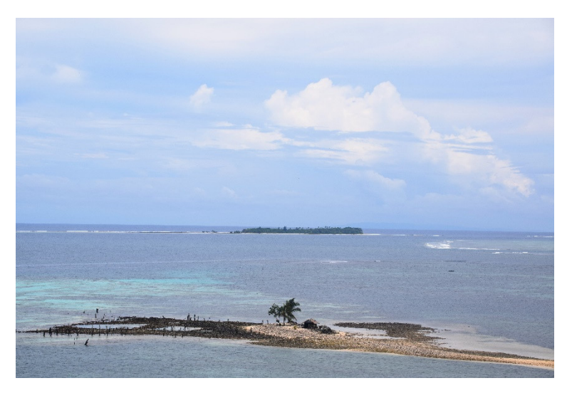
Figure 9. Walande Island on South Malaita (J. van der Ploeg, 2018).