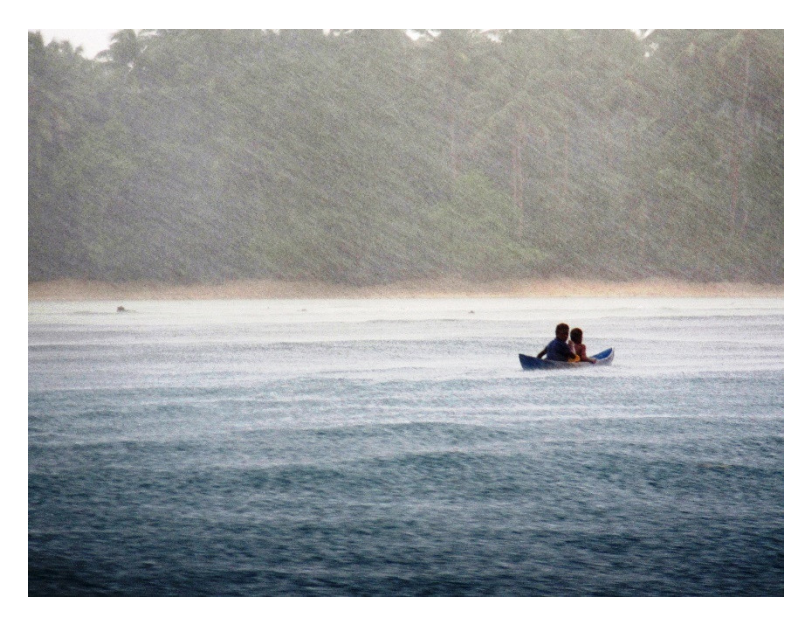
Figure 10. Children on their way to school (J. van der Ploeg, 2016).

indication that extreme rainfall or drought is currently threatening food security on Malaita. The notorious 1997/1998 El Niño drought affected gardens in North Malaita, but the most serious problems were felt in the urban centers and on remote coral atolls [76]. Historically, the wane asi cultivated swamp taro, yams, and sweet potatoes on the mainland. Traditional crop rotation schemes and fallows have been shortened as farming systems have intensified over the past fifty years [77]. Consequently, soil degradation, erosion, and pests have become serious problems. Agricultural development is further hampered by a structural lack of technology, skills, credit facilities, farm-tomarket roads, reliable energy supplies, and agricultural extension services [78]. There are a number of concerns about food security and nutrition on Malaita, particularly related to the replacement of traditional diets by cheap, nutritionally-poor imports, such as noodles, and its long-term impacts on health [79]. A number of other interconnected social and political problems, such as youth unemployment, poor healthcare and education, gender-based violence, land tenure disputes, corruption, alcoholism, urbanization, and expectations of modernity further contribute to food insecurity and health problems. These multiple stressors highlight the complexity of contemporary food systems [80] and the limits of focusing on a single explanatory factor when trying to solve these problems.