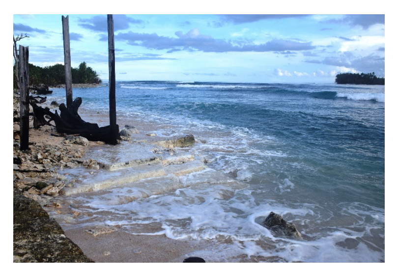
Figure 4. The remains of the Anglican church of Fanalei (J. van der Ploeg, 2018).

from the uplands. Ngongosila was settled in 1955 when the South Sea Evangelical Mission built a church on the island [29].