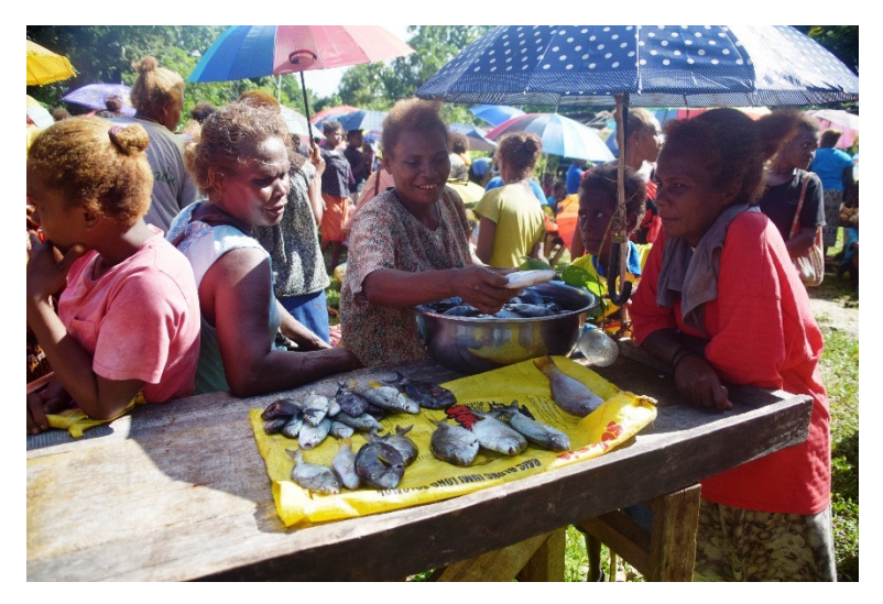
Figure 2. Women barter fish for root crops in Lau Lagoon (J. van der Ploeg 2017).

Little is known about the origins of the "island builders of the Pacific" [20]. Oral history recounts that the first artificial islands were constructed in the 16th century by people from the uplands of Malaita fleeing from war, sorcery, or famine [21]. It has also been postulated that the island settlements were an adaptation to endemic malaria in the lowlands [22]. In any case, a vibrant culture developed in the lagoons and mangrove forests of Malaita. The most important ethnic groups are the Lau, on the northeast coast, and the Langalanga, on the west coast.